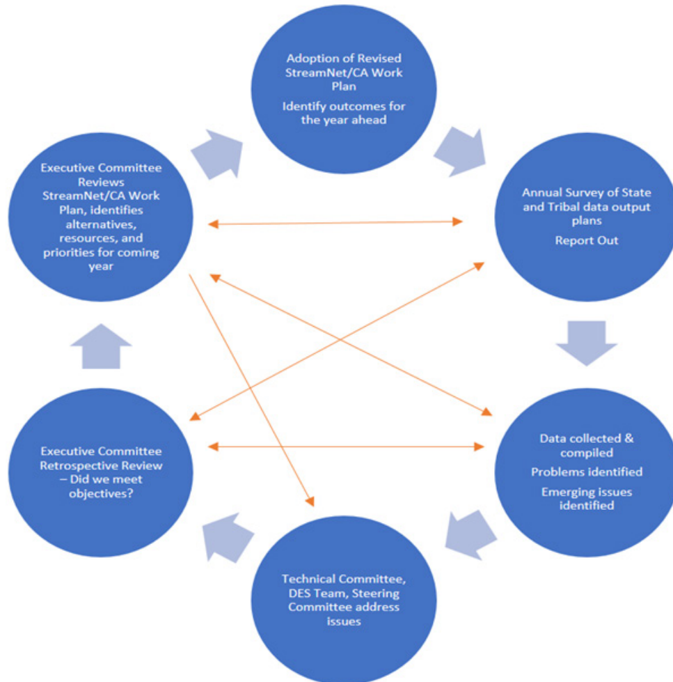
Figure 1. StreamNet adaptive management process outline

Following is an adaptive management process outline ( in bold ), followed by examples or descriptions of how this is currently used or will be used in the future.