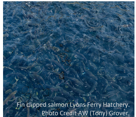
Fin clipped salmon Lyons Ferry Hatchery.

To learn more, access HCAX meeting documents at Hatchery Data Sharing (HCAX) . Next steps include engaging the data stewards participating in the HCAX (i.e., HCAX Data Manager Work Group) to develop data sharing rules and procedures.