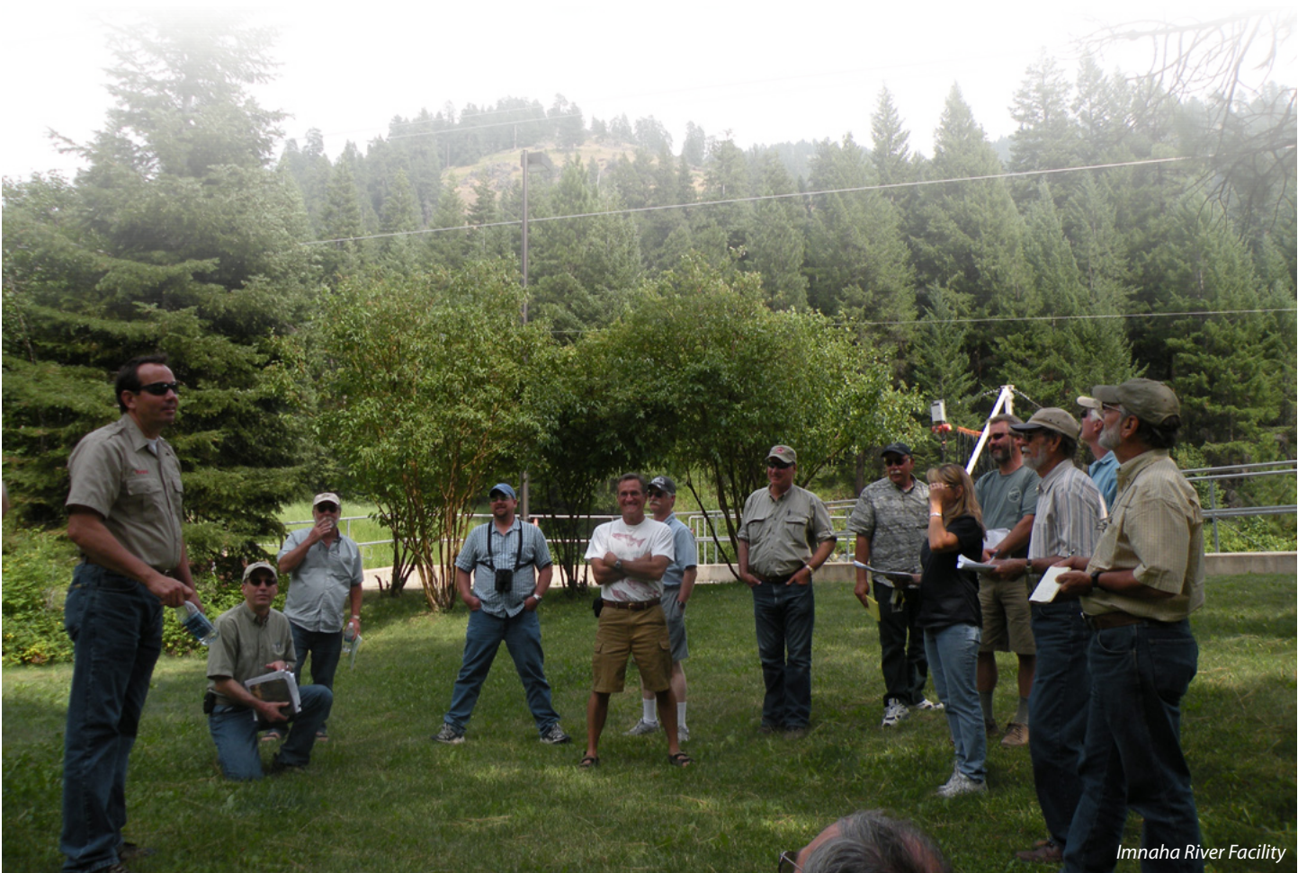
Imnaha River Facility